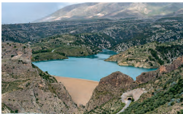
Figure 1: Reservoir of Castriil in the Guadalquivir basin.